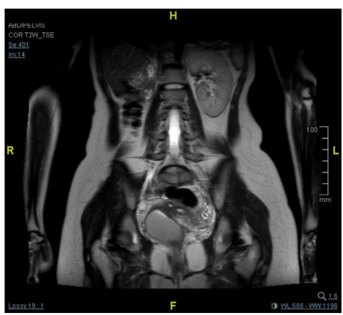
Figure 2: Coronal view of Magnetic resonance imaging scan showing absent of right kidney (renal agenesis) with normal left kidney.